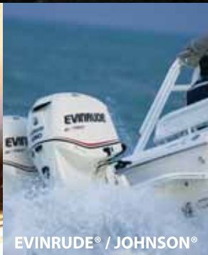
EVINRUDE® / JOHNSON®